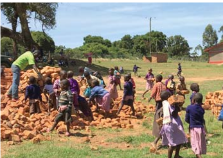
Kindergarten students excited about their new classroom help the team move and stack bricks.

There was also time to learn about the Maasai culture including visits to a small village. As in the United States some beliefs are changing; newer generations are not as apt to have multiple wives and