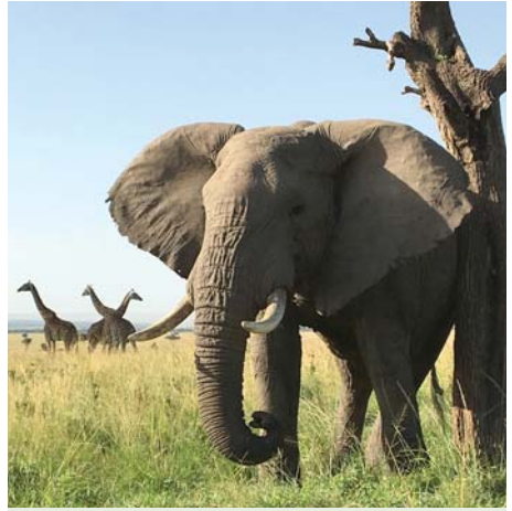
Elephant and giraffes seen while on safari.

While people tend to think of mission trips as just helping people in areas of