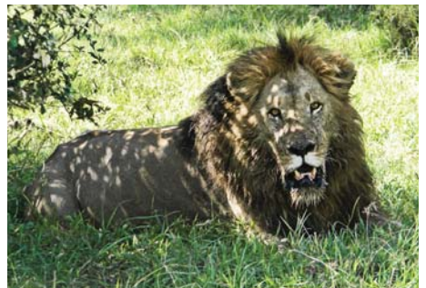
King of beasts lion around waiting for prey. I'm not lion, this was an beautiful site to see.